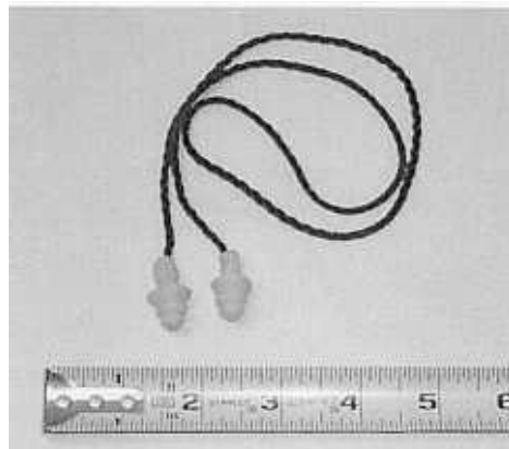
Test Item: Q307A

These data were obtained through measurements made at the laboratories of Michael & Associates, Inc., State College, PA , USA. Michael & Associates, Inc., is accredited to test to ANSI S3.19-1974 and ANSI S12.6-1984 by the National Institute of Standards and Technology (NIST) National Voluntary Laboratory Accreditation Program (NVLAP).